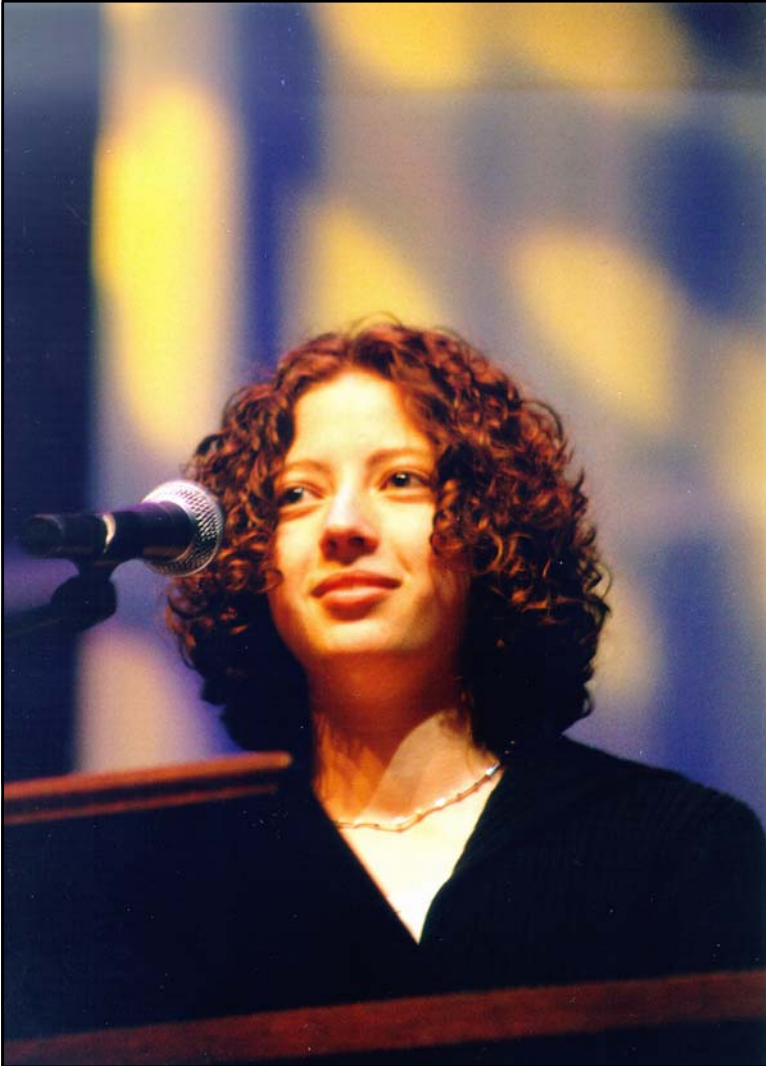
Elizabethtown College students do things they never imagined possible for themselves.